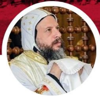
H.E. Metropolitan Youssef